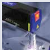
Laser Marking Systems