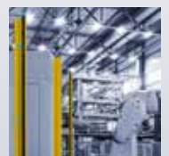
Safety Light Curtains