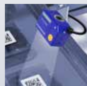
Stationary Industrial Scanners