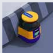
Safety Laser Scanner