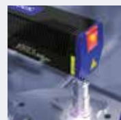
Laser Marking Systems