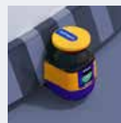
Safety Laser Scanner