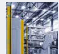
Safety Light Curtains