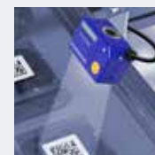
Stationary Industrial Scanners