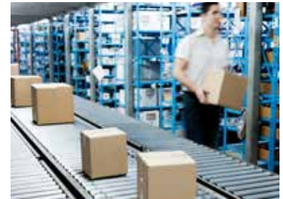
Manual Postal sorting